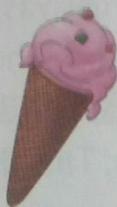
an ice cream